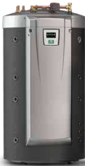
CTC EcoZenith i555 Pro * Basic