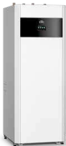
CTC EcoPart i600M * Basic