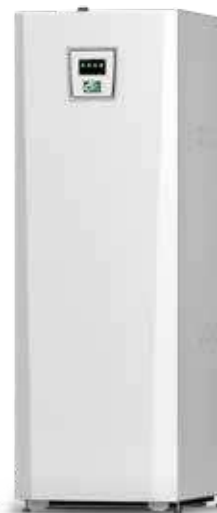
CTC EcoPart 400 Pro * Basic