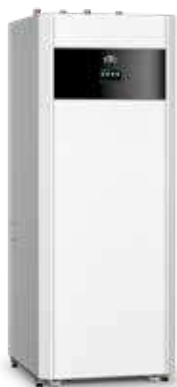
CTC EcoPart i600M