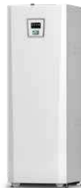
CTC EcoPart 400 Pro