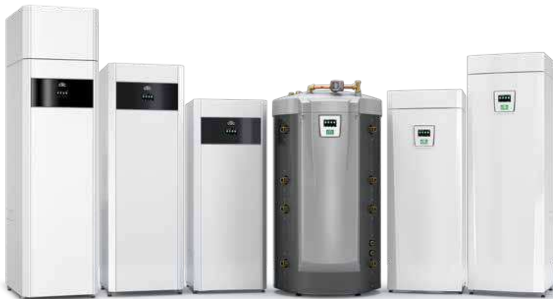
CTC EcoVent i360F

– refer to individual product sheets for more detailed information.